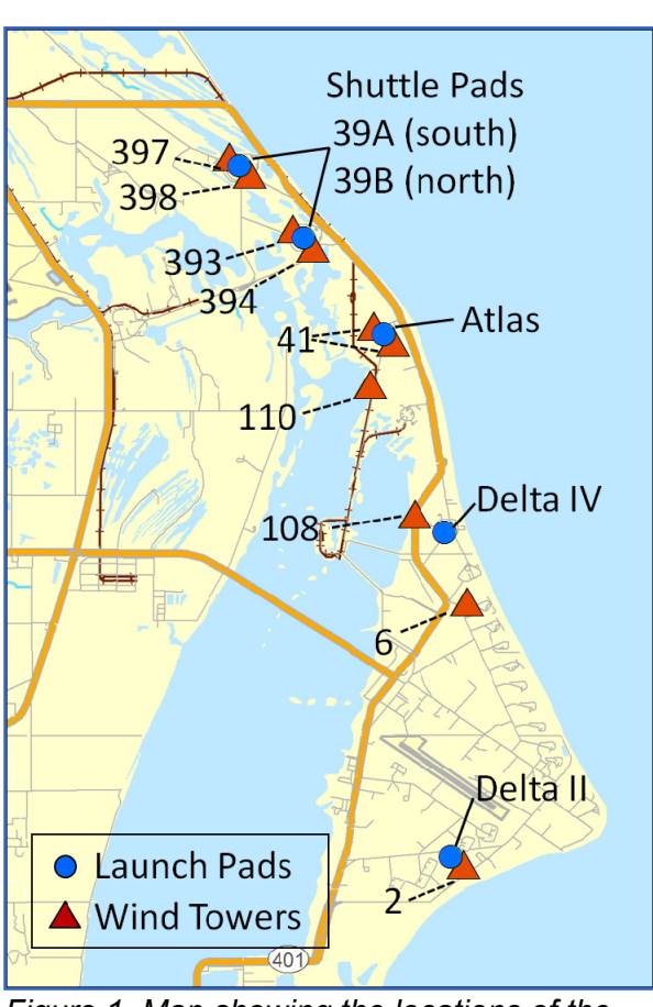
Figure 1. Map showing the locations of the launch pads and LCC wind towers described in Table 1.

where g is gravity, z is height, \Theta_v is the virtual potential tem-